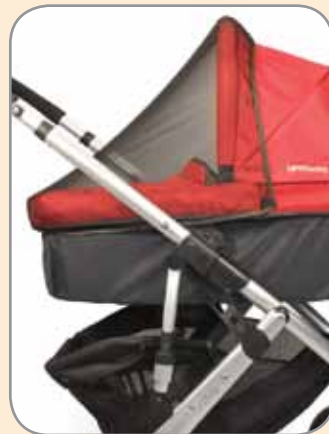
Proper installation of Bassinet bug shield