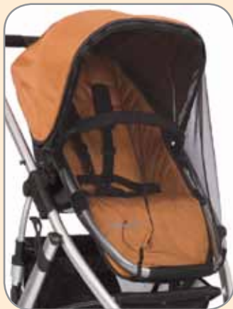
Proper installation of bug shield