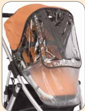
Proper installation of rain shield